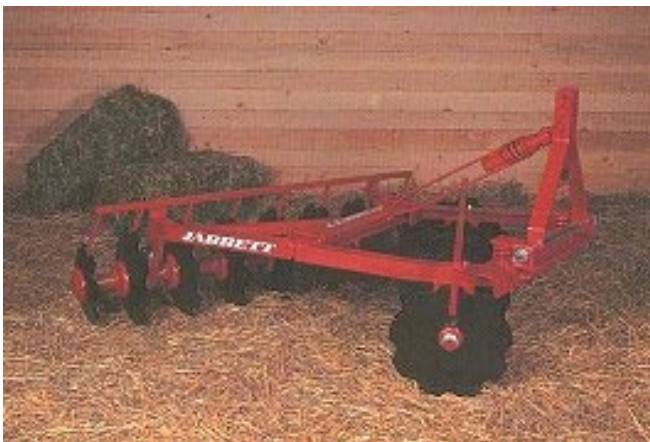
The BS1618 linkage disc cultivator