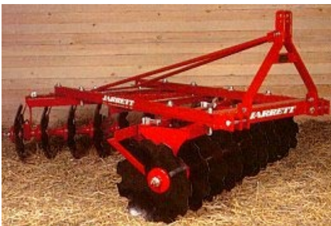
The CS1822 linkage disc cultivator