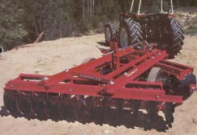
The TD2424 (24 disc) trailing disc cultivator (rear view)