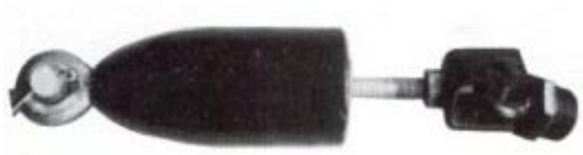
Mole drainer with poly pipe attachment