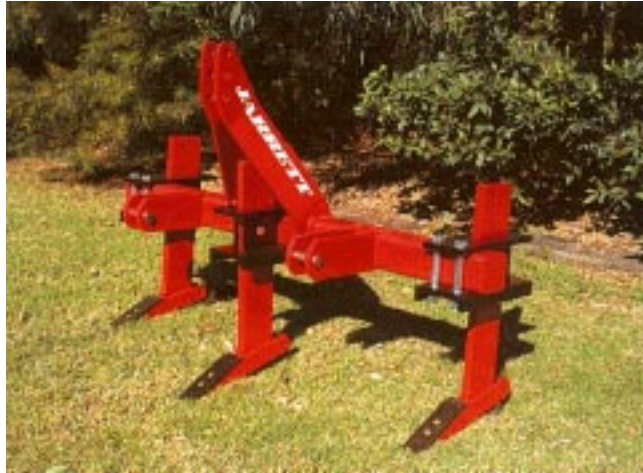
The MR (multi tyne) ripper