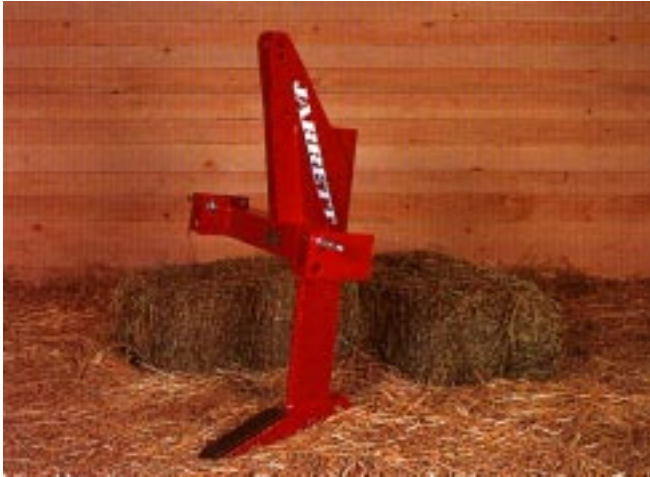
The SR (single tyne) ripper